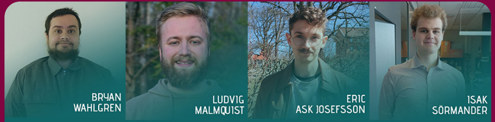
Linnaeus Union board 2022/2023

We are the student union at Linnaeus University and we work every day to improve your studies and your time here. We make sure that you get the education you are entitled to, we support students in their search for accommodation and do our best to see to that your life outside the studies is as eventful as possible.