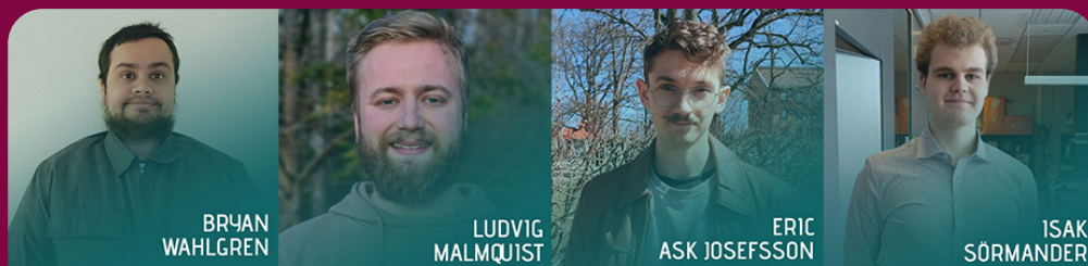
Linnaeus Union board 2022/2023

We are the student union at Linnaeus University and we work every day to improve your studies and your time here. We make sure that you get the education you are entitled to, we support students in their search for accommodation and do our best to see to that your life outside the studies is as eventful as possible.